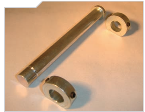
Dummy gauge and mounting brackets

The following other data sheets are associated with this data sheet: