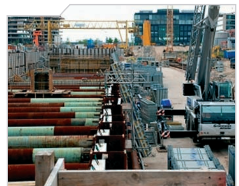
Typical application of WSM1 is for monitoring struts

Our innovative system has a unique integral magnet design which incorporates a miniature magnet coil assembly positioned inside a stainless steel tube of diameter 15 mm. The same tube has a high tensile strength, heat-treated and tempered steel wire stretched between two end blocks. The wire is sealed in the tube by means of a set of double O-rings.