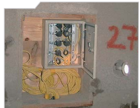
Collecting box in the sidewall for comfortable taking of readings