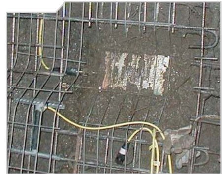
Pressure cell for determining the contact stress between ground and shotcrete-shell (in combination with strain meters)