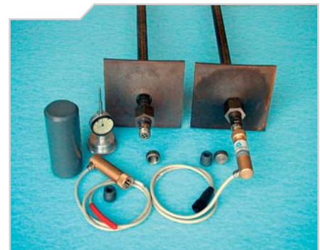
Measuring heads with displacement transducers and dial gauge set